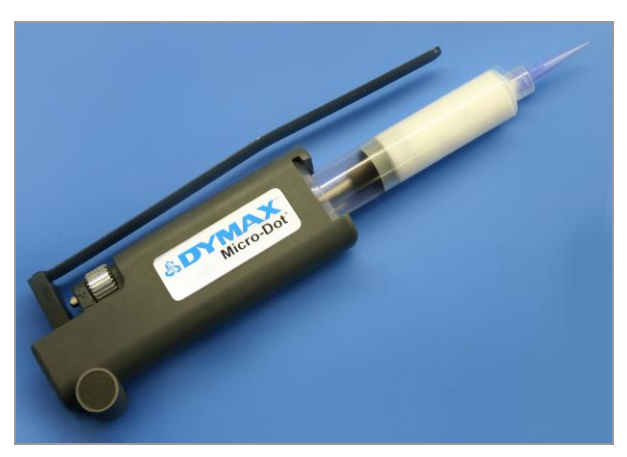
Lever Activated Micro-Dot Syringe Dispenser (T20010)