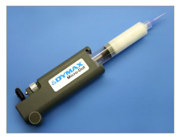
Thumb Activated Micro-Dot Syringe Dispenser (T20000)

The Micro-Dot™ portable syringe dispenser offers positive-displacement accuracy for dispense volumes as small as 0.0003 mL. Once a volume is set it can be repeated with accuracy. This syringe dispenser utilizes a pre-packaged disposable syringe as its fluid reservoir, preventing any contact between the fluids and the dispenser eliminating fluid contamination during dispense. With the proper dispense tip selection, the Micro-Dot is suitable for dispensing a wide range of low-to-high viscosity fluids including pastes, lubricants, adhesives, sealants, and more.